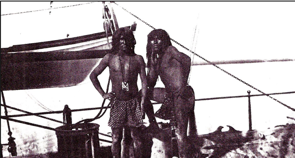
Two Yuman Speaking Indians, probably Cocopah's. On board a hydrological sip in 1874.